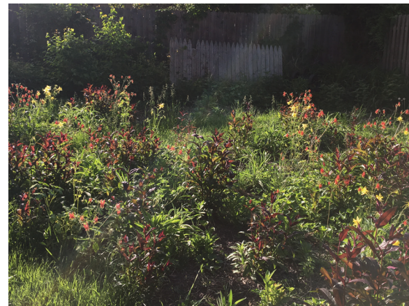
4. Each season brings new colors as your meadow matures.