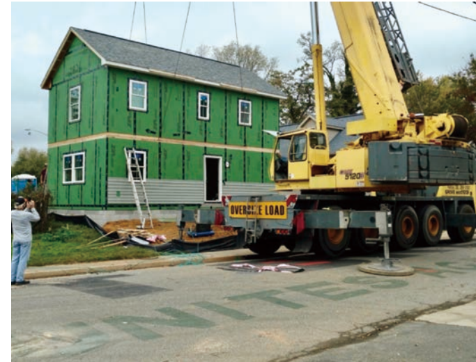
A healthy environment and safe, affordable housing can and must go hand in hand. ShoreRivers has partnered with new nonprofit Kent Attainable Housing to create River-Friendly Yards with each of their clients.