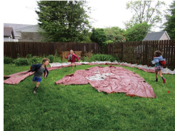
2. Lay paper or other material to kill grass; frolicking encouraged.