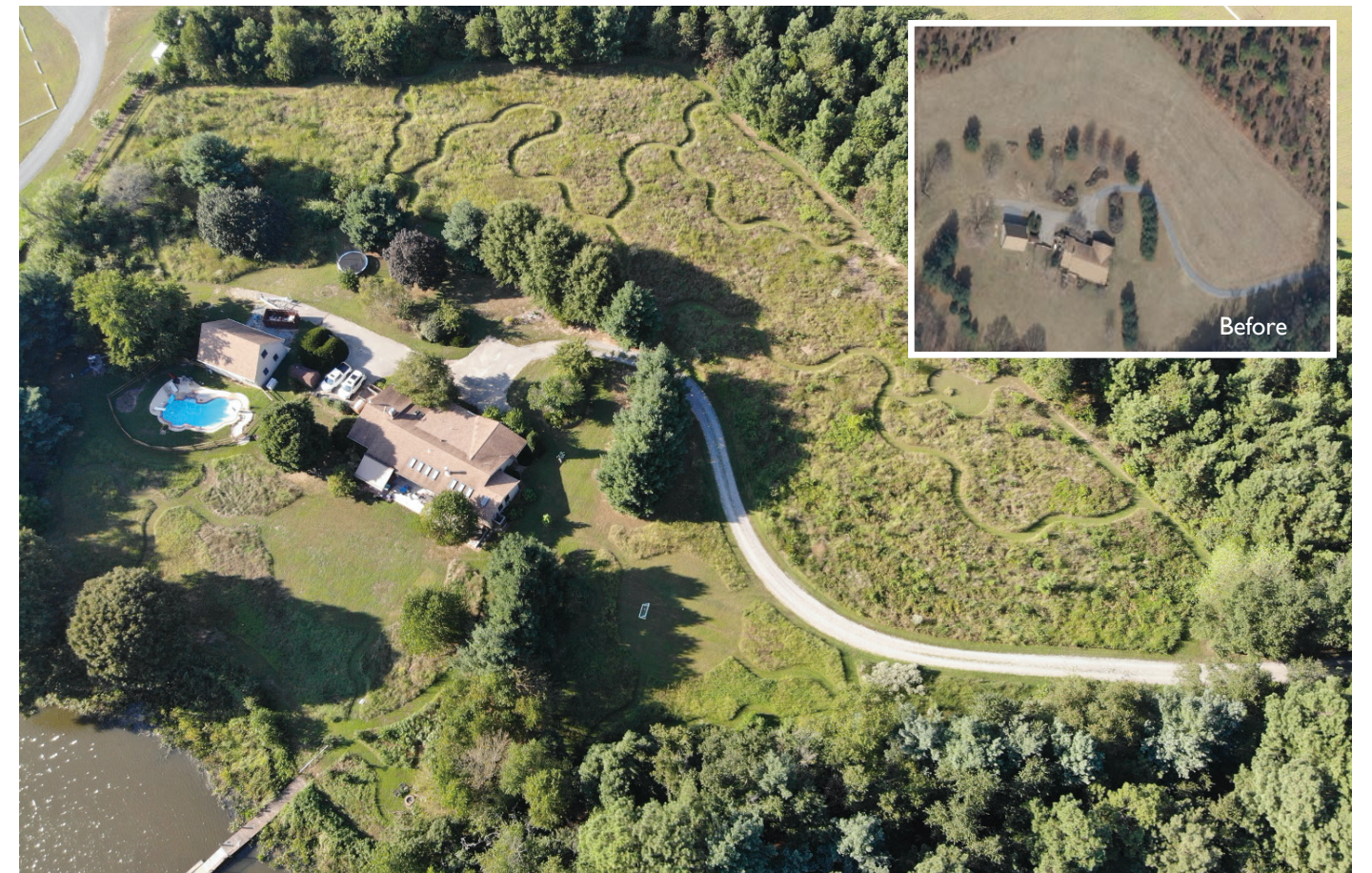
Former Chester Riverkeeper Tim Trumbauer mowed a winding path for kids and adults to enjoy. The natural meadow that now grows includes natives like black-eyed susans, purple coneflowers, and milkweed.