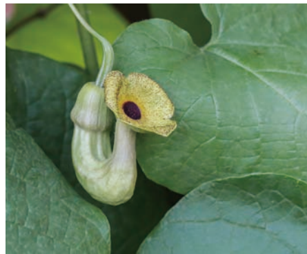
Dutchman's Pipe ( Aristolochia macrophylla )