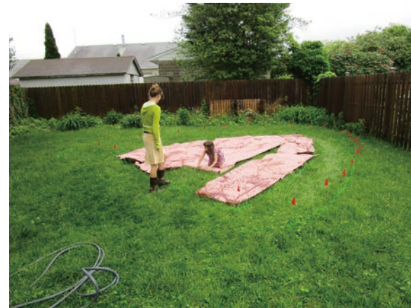
1. Mark mini-meadow area with paint or flags.

Making a Meadow: One of the most impactful and gratifying changes you can make in your yard is to designate a section for meadow and habitat.