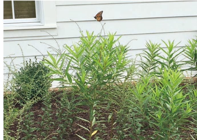
The community of Easton Village added beautiful, professional native landscaping to their club house and several community spaces.