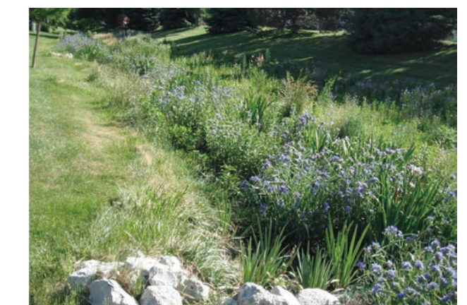
A planted bioswale looks and performs much better than a drainage ditch.