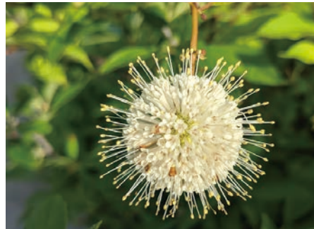
Buttonbush ( Cephalanthus occidentalis )