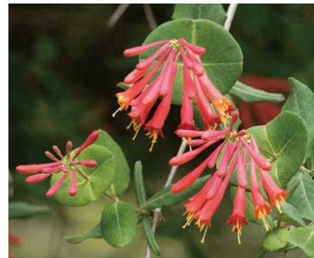
Coral Honeysuckle ( Lonicera sempervirens )