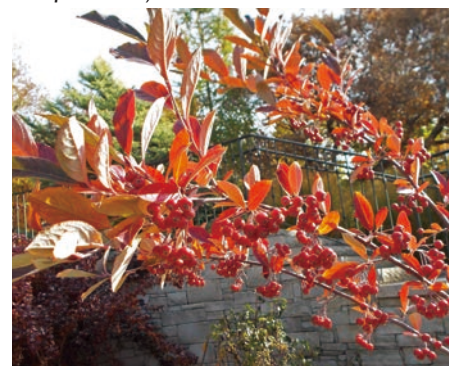
Red Chokeberry ( Aronia arbutifolia )