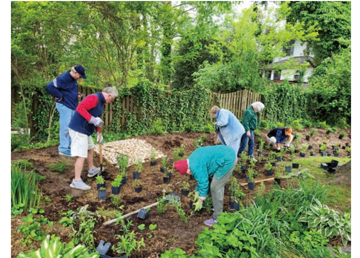
St. Paul's Church in Centreville became a River-Friendly Congregation, putting creation care into action by building a rain garden.