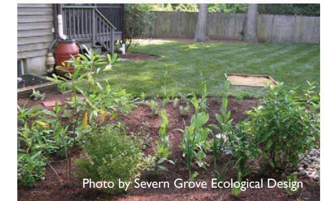
A rain garden can absorb stormwater from your property.