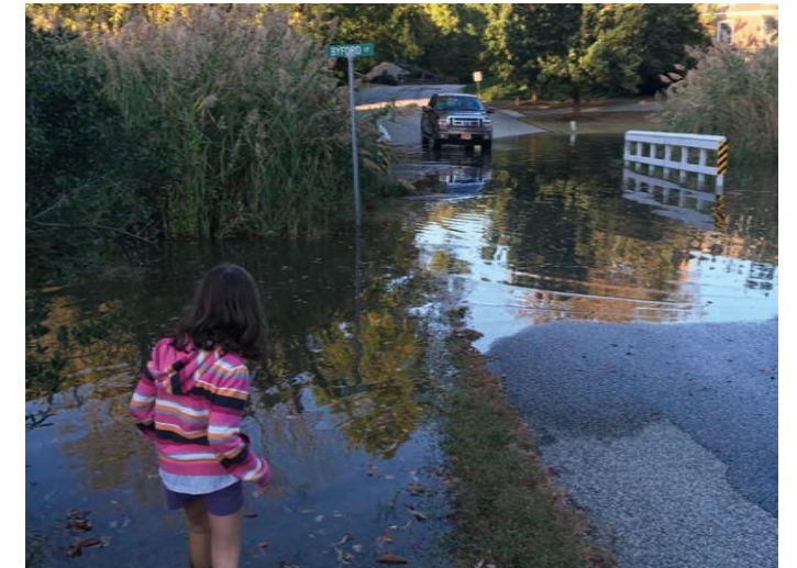
More frequent and severe rains mean more pollution washed into our waterways.

As climate change triggers more rainfall, warmer temperatures, and more extreme weather events, threats to our native pollinators and our waterways are increasing. We all need to work together to protect and restore our rivers, streams, and the Chesapeake Bay for a swimmable, fishable future.