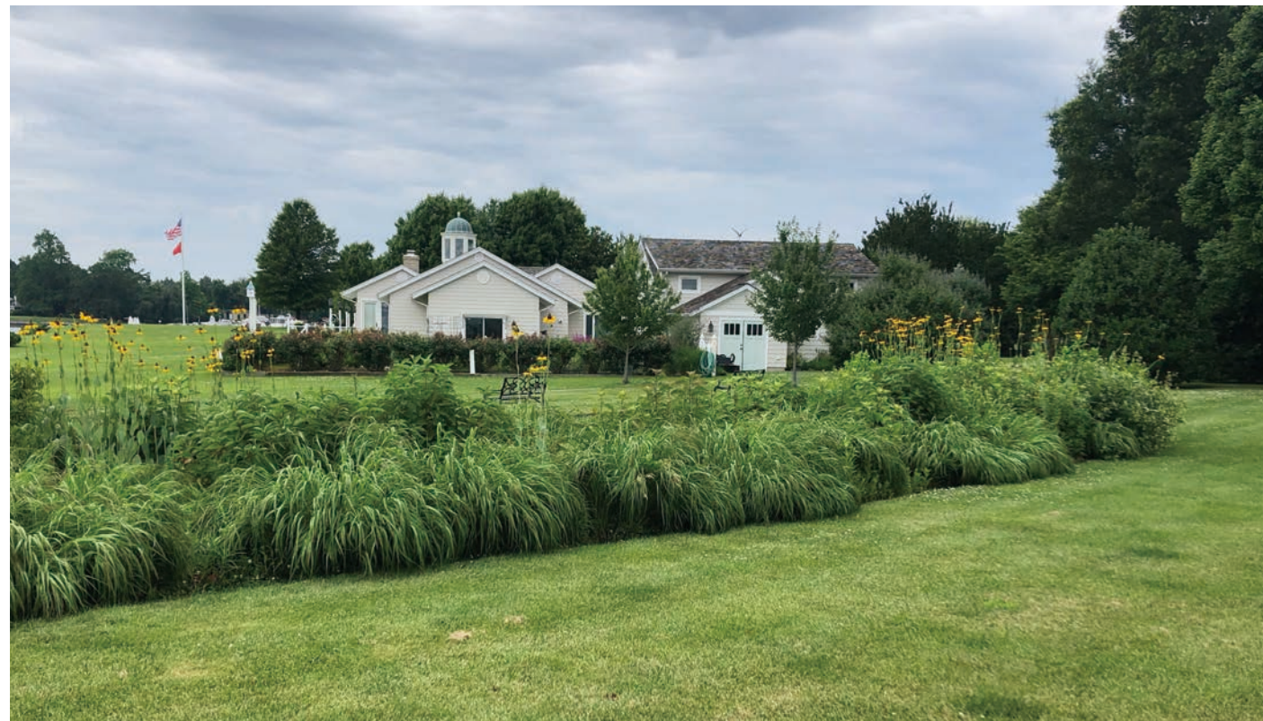
Our rivers are polluted with excess nutrients (fertilizer) and sediment (soil). Native plants can absorb nutrients and keep soil in place so the water that reaches our rivers is clean.

In a time when it is easy to feel despondent about our environmental future, there is real hope in your yard of any size. We are learning that stitching together small habitats into conservation corridors may make the essential difference we need for all species, including our own, to thrive. This booklet contains River-Friendly Yards practices and resources to empower you to make positive change in your own backyard.