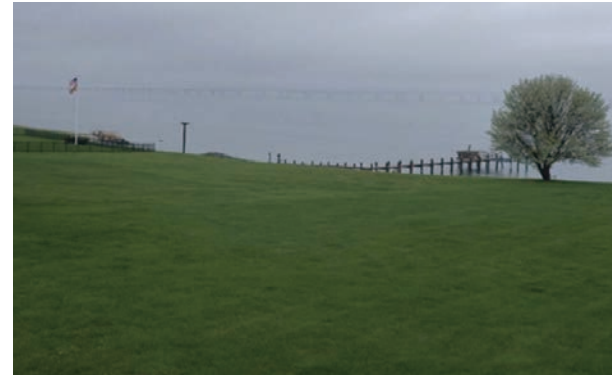
What happens here? Often the most time people spend on their lawns by far is mowing them.