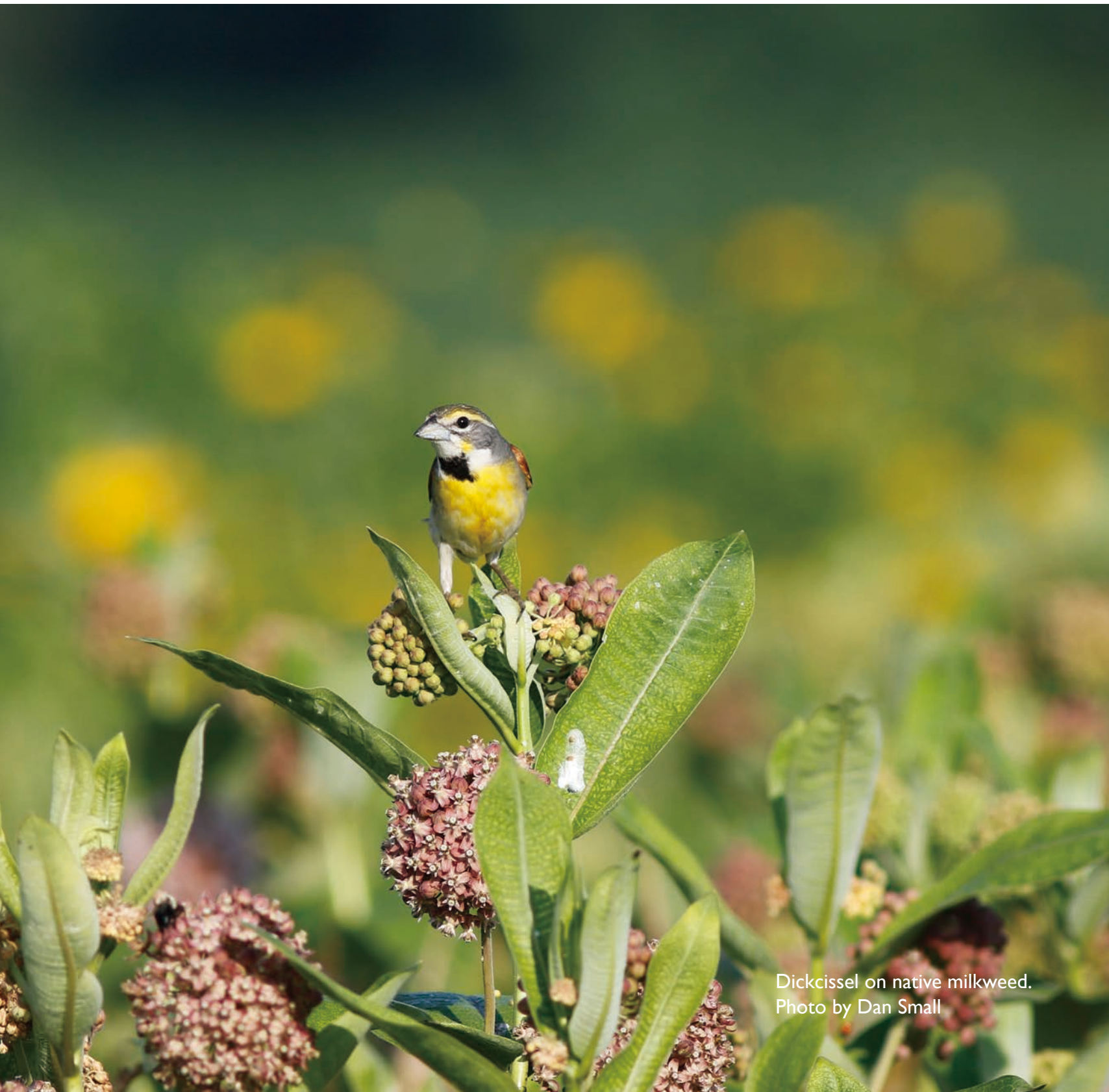
Dickcissel on native milkweed.