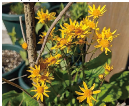
Golden Ragwort ( Packera aurea )