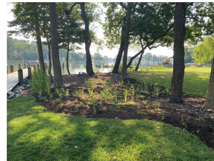
A River-Friendly Yard practice on Greenwood Creek incorporates berms and a rain garden into existing landscaping to capture and treat runoff from several neighbors' properties.