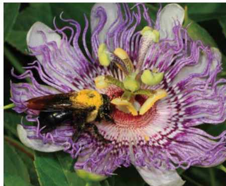
Passionflower ( Passiflora incarnata )