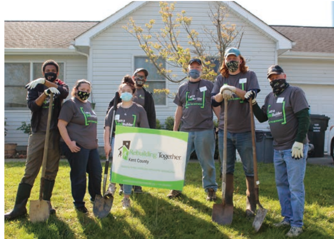
ShoreRivers partnered with the volunteers of ReBuilding Together to bring a River-Friendly Yard to a homeowner in Butlertown at no cost.

Together, ShoreRivers and our partners are empowering a diverse community of environmental stewards and creating beautiful, meaningful water and habitat projects.