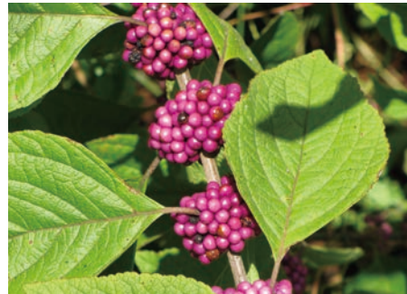
Beautyberry ( Callicarpa americana )

Non-native and invasive plants provide little to no habitat benefit, do not support our native ecosystems or food webs, and often outcompete native plant species. From now on, choose beautiful and useful native species, like the ones listed below. Cultivars, or cultivated varieties, may not have the same ecological benefits as true natives. Look or ask for true native species at your local plant nursery.