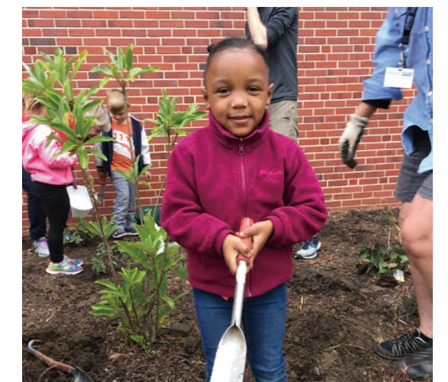
Plant in the fall: invite a friend to help!