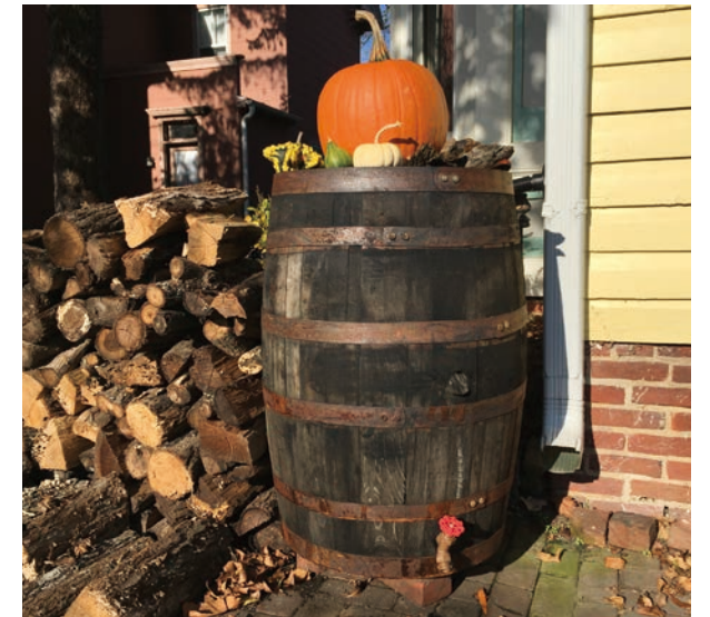
Rain barrels can be both attractive and useful.