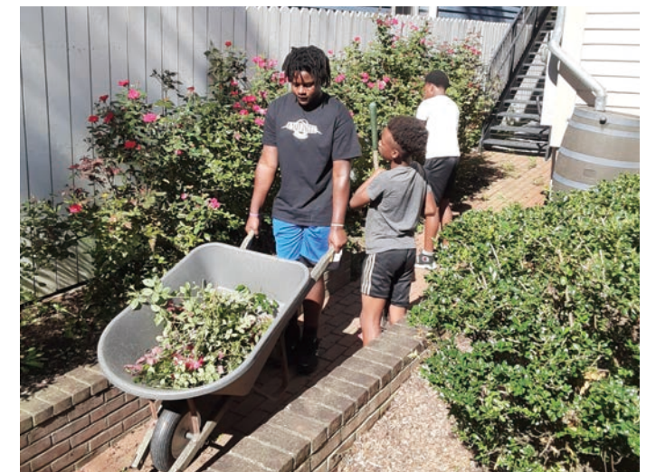
Young men in the Rising Sons mentorship program help to plant native shrubs to stop erosion at Sumner Hall, Chestertown's African American cultural center.