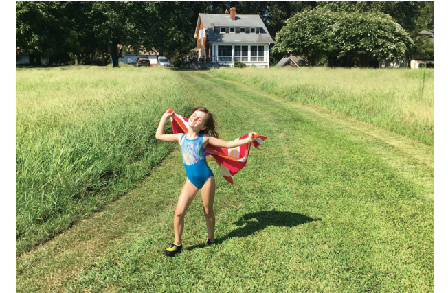
Be a hero: go long and mow a path through your meadow.