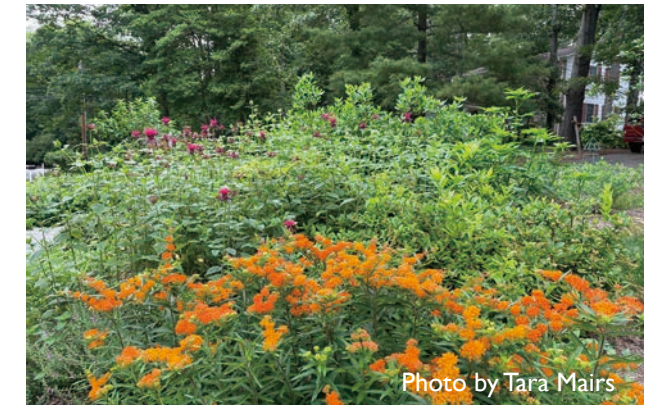
Layered conservation plantings include native plants of different heights and colors.