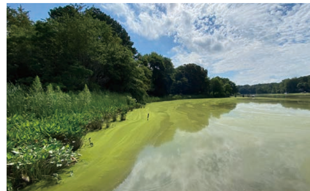
Algal blooms like this one on the Chester River are often caused by fertilizers running off into our waterways. Native plantings and buffers can stop nutrient pollution in its tracks.

Grass farmers: Turf grass is now Maryland's single biggest "crop," covering over 1.3 million combined acres. Research by the Chesapeake Stormwater Network found that Bay residents spend nearly $5 billion dollars a year on turf lawns. Millions of those dollars go to chemicals that end up in our water. The impact of our lawns is truly huge.