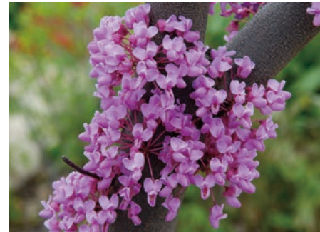
Redbud ( Cercis canadensis )