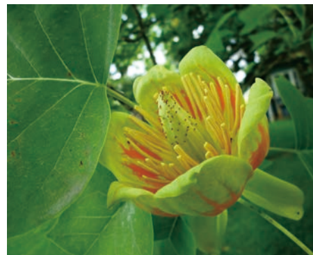
Tulip tree ( Liriodendron tulipifera )