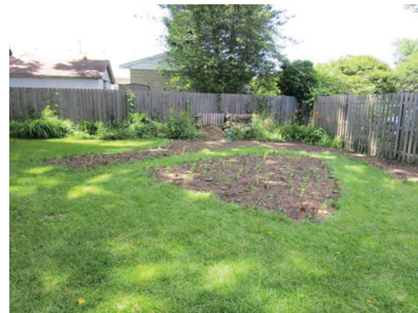
3. Plant plugs through mulch.